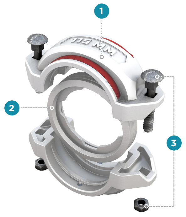
Push to Connect Marine Grade Aluminum