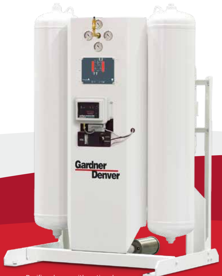
Purifier shown with optional Carbon Monoxide Monitor