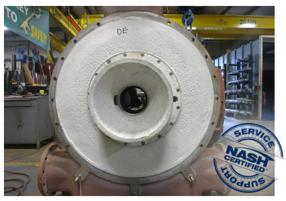
NASH Certified repairs include machining the surfaces to return to OEM specs and an epoxy coating to prevent erosion damage, increasing the life span of the head.