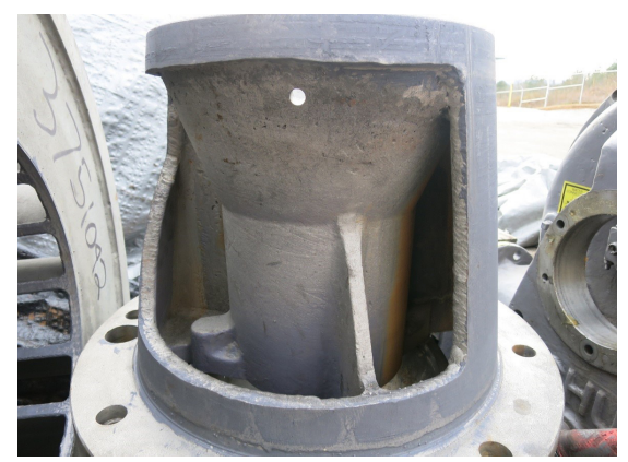
The 'Other" Shop returned the pump to the customer with a visibly worn cone surface, and cone tip measurements that do not meet spec.