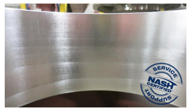
NASH Certified repairs bearing bores with sleeving and machining that uses a fine smooth machine to insure precise measurement, returning the bore to spec.