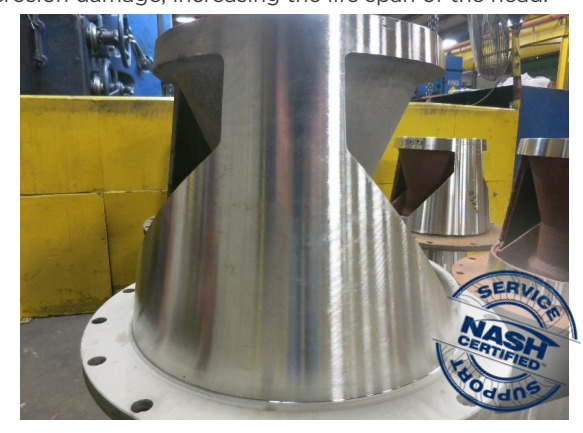
NASH Certified repairs cones by cladding and machining to OEM specs. Stainless cladding is used to extend the life of the cone.