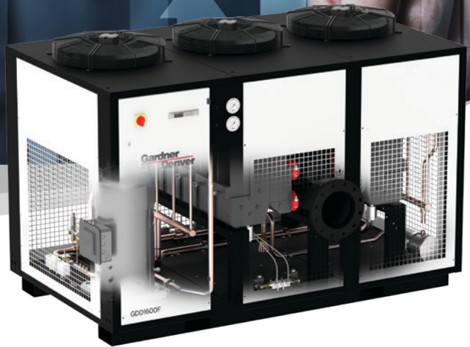
Model shown GDD1460F