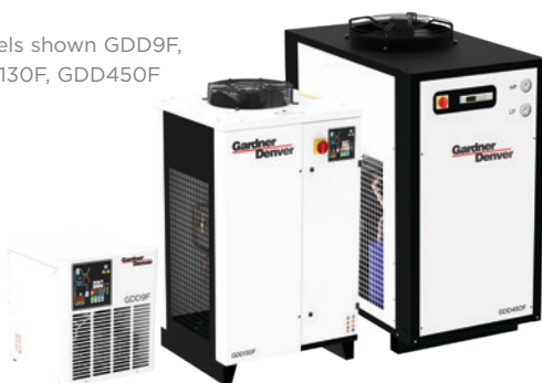
Models shown GDD9F, GDD130F, GDD450F