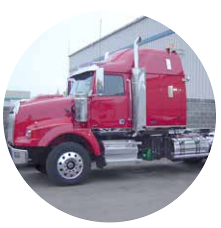
CycloSaver compact installation

Maximum flow and pressure listed. Actual performance may vary based on system design, environment, and maintenance.