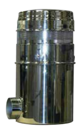
Stainless Steel Filter