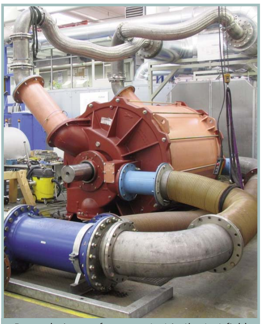
Pump during performance test in the test field

Gardner Denver Nash supports you when commissioning systems and during troubleshooting, which reduces expensive breakdown times. Our employees have many years of experi-