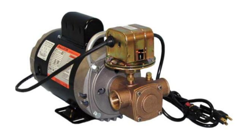
WATER 60 ° F