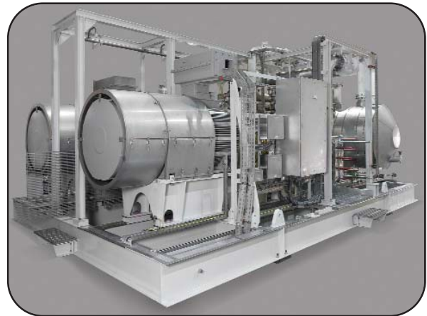
Gjøa Platform, North Sea

Built by K-Lund, Norway, featuring a NASH NAB 1500 two stage liquid ring compressor. Designed for a flow rate of 1500 m 3 /h and a discharge pressure of 6 to 9 bar absolute