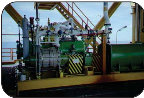
NASH 2BG Compressor used for vent gas compression on an offshore rig

Built by K-Lund, Norway, featuring a NASH NAB 1500 two stage liquid ring compressor. Designed for a flow rate of 1500 m 3 /h and a discharge pressure of 6 to 9 bar absolute