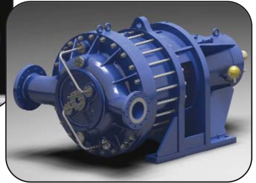
NASH HP-9, Vectra and NAB/NAM Compressors are tireless workhorses, ideal for your offshore applications