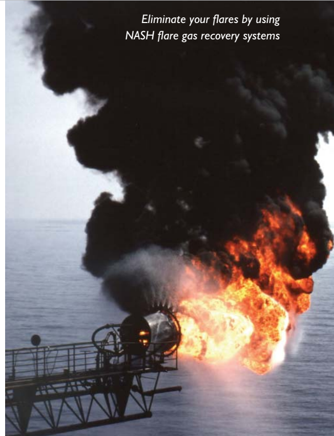
Eliminate your flares by using NASH flare gas recovery systems