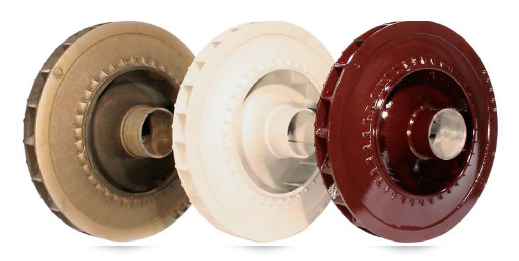
In-House Sandblasting and Heresite Coatings and Heresite Coatings.