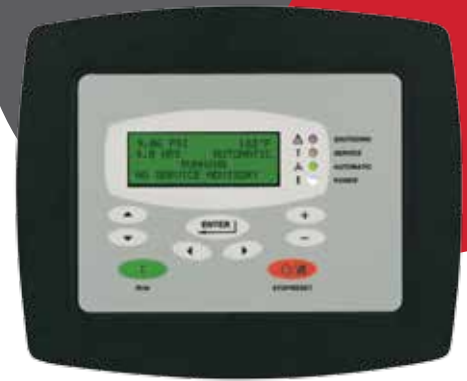
Air Smart Controller