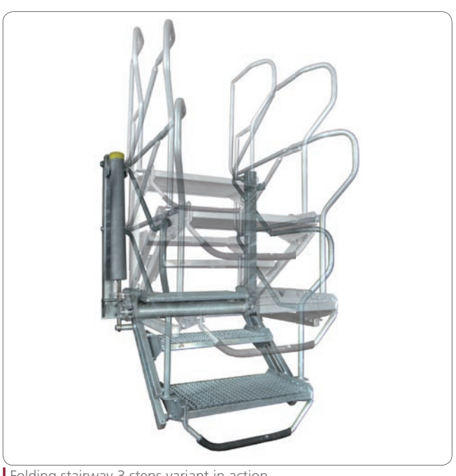
Folding stairway 3 steps variant in action