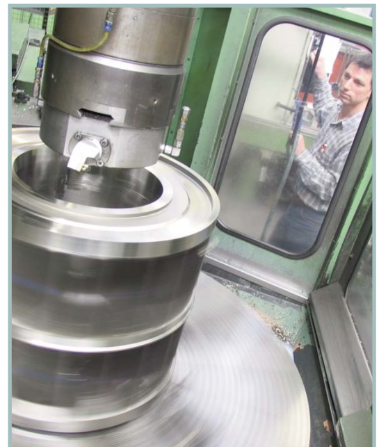
Refinishing of an impeller

Before being shipped out, vacuum pumps and compressors can be thoroughly tested in our test field. If all specified parts were replaced with new parts we could guarantee 95% of the suction capacity of a new pump. Testing of pumps can also be carried out locally at the customer's plant on request.