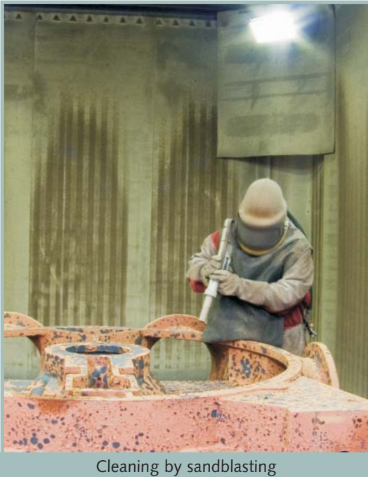
Cleaning by sandblasting

Repair costs are based on defined work steps. We dismantle your pump, inspect the parts in order to determine whether reworking of parts is possible or whether components have to be replaced. Then you receive a detailed offer with a description of all defects and digital photos to document the damage. A local inspection provides another aid for helping our customers make a decision. Our price list describes the costs for standardized work.