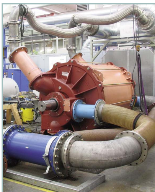
Pump during performance test in the test field

Gardner Denver Nash supports you when commissioning systems and during troubleshooting, which reduces expensive breakdown times. Our employees have many years of experience in complete vacuum and compressor systems. With our experience and our close cooperation with customers, we ensure the optimum operation of your systems - right from the start.