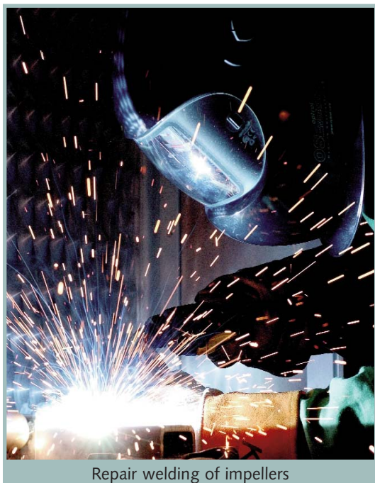
Repair welding of impellers

Your system's downtimes are minimized with the Gardner Denver Nash pump exchange program. Regardless of the manufacturer or the pump model: We can provide you with an overhauled exchange pump from our pump pool at the time most suitable for you. It is assembled according to your specifications (speed, material, single or dual-acting seals and many other options). In the process we use new and used stock parts.