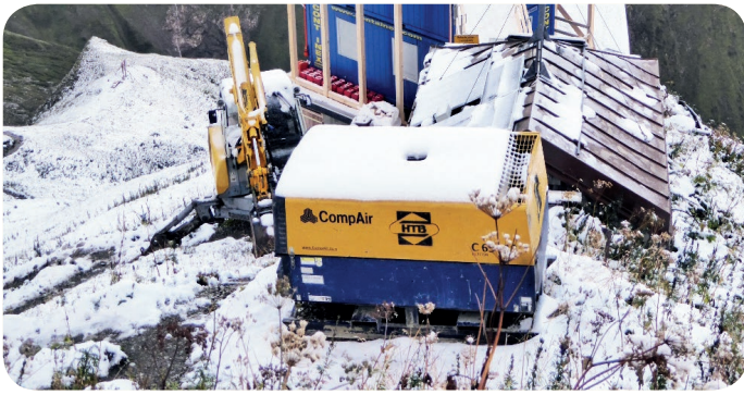
An extra cold start device, shown here in use on a construction site at an altitude of more than 2,000 m in the Allgäu Alps, ensures that the engine starts even in adverse weather conditions.