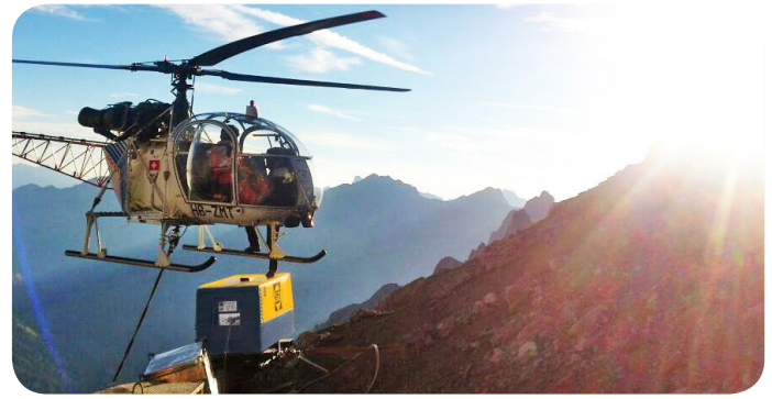
Smaller helicopters, such as the Aérospatiale SA-315 shown here, are cheaper per hour. Air transport represents one of the main costs on construction sites at high altitude.