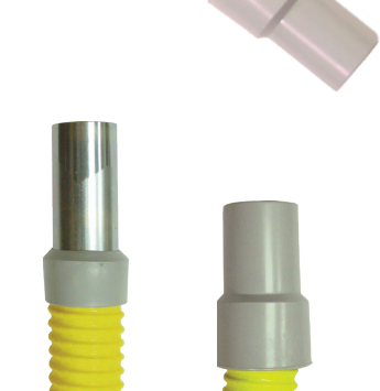
"AFW" Style Cuff