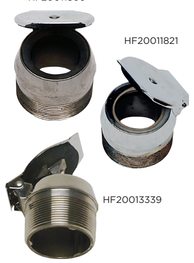
*Only Paint Cast Iron Inlet Valves