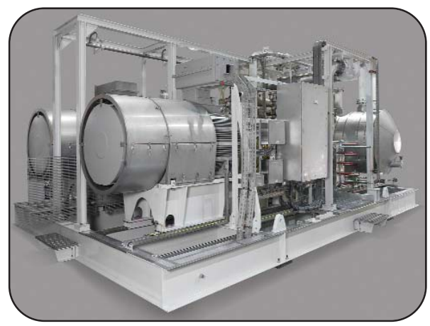
Gjøa Platform, North Sea Built by K-Lund, Norway, featuring a NASH NAB 1500 two stage liquid ring compressor. Designed for a flow rate of 1500 m<sup>3</sup>/h and a discharge pressure of 6 to 9 bar absolute