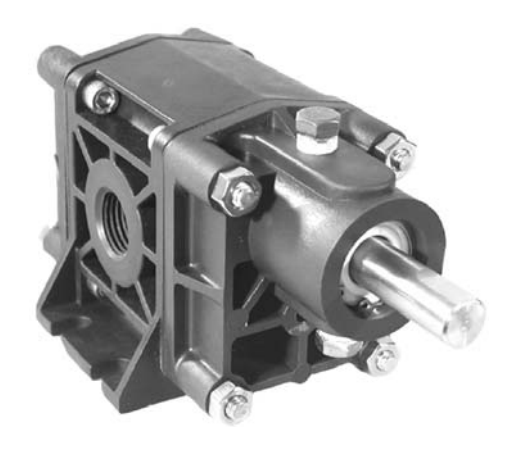
A full range of accessories are available including: kits for base mounting, or close-coupling, line mount relief valves.