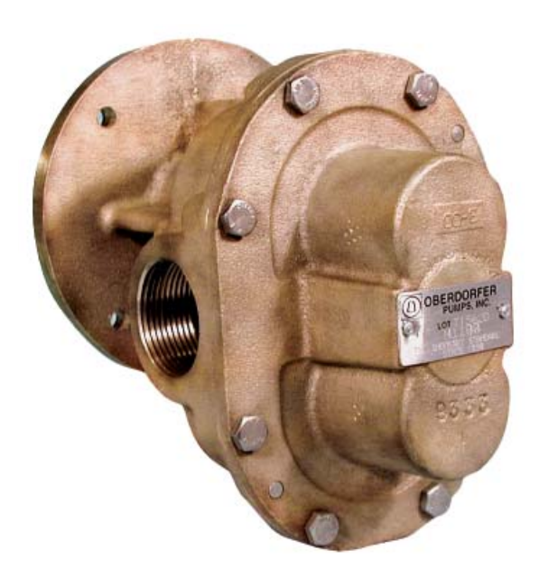
Refer to Model No. N11HDL for pedestal model and performance at different speeds.