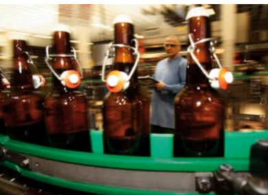
Gardner Denver compressors are used in breweries and bottling operations throughout the world.