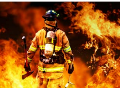
Gardner Denver compressors fill breathing air into tanks used by rescue teams and scuba divers.

In addition, before entering into an agency type relationship with a third party (e.g., sales agent, sales representative, dealer, distributor, etc.), you must follow the Company's Anti-Corruption Compliance Policy. This policy requires you to complete a transaction partner due diligence evaluation and follow certain processes to verify the reputation of the third party and thereby minimize the risk of bribery or corruption. If you have any questions about this policy or process, contact the Compliance Department.