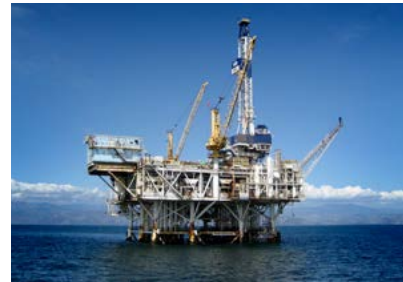
Gardner Denver compressors and pumps are used in the exploration of oil and natural gas.

Gardner Denver has been in business for nearly 160 years. We maintain customer loyalty by developing innovative, high quality products that meet the needs of our customers. Our goal is to be #1 in customer satisfaction across all our products and brands.