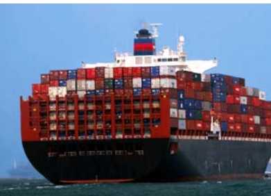
Gardner Denver compressors are found on freight and cruise ships around the world.