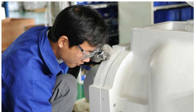
Gardner Denver Nash employees thoroughly inspect every pump to ensure we exceed customer expectations.

From time to time, you may be notified of the need to retain certain records in connection with a legal matter. That is called a "legal hold." You are required to comply with the request and strictly prohibited from modifying, deleting, erasing, discarding or otherwise destroying any records that must be preserved.