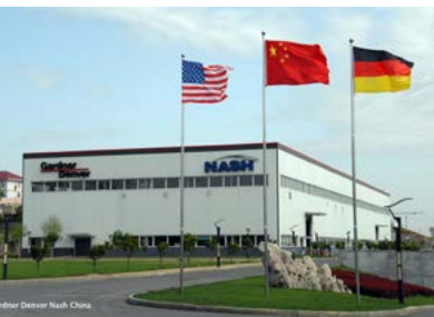
The Gardner Denver facility in Boshan, China, manufactures liquid ring vacuum pumps and multistage centrifugal fans for a global customer base.

The Company may monitor or access documents on its systems at any time within the limits of the law. Gardner Denver acknowledges that in some countries outside of the U.S., employees have limited privacy rights for personal data located on Company-issued employee computers. Where necessary, Gardner Denver respects such rights with regard to such data.