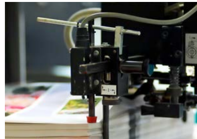
Several Gardner Denver products are used in the paper industry, from turning pulp into paper to printing newspapers and magazines.

Rohini's team is working on a project that has a tight deadline and the team realizes at the last minute that they need to print an extra set of brochures or they will miss it. Rohini's husband owns a print shop, but before they ask him to print the brochures, they consult the Compliance Department because they realize that the situation creates the appearance of a conflict and a potential conflict must be disclosed. An independent review by the Compliance Department protects all those involved should the situation ever come into question.