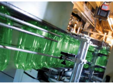
Gardner Denver compressors provide high pressure air used to blow plastic bottles into thousands of different forms.