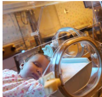
Gardner Denver provides key components for equipment used in patient care, laboratories, pharmaceutical research and production.

All electronic data stored on Company computers is the property of the Company. Employees should have no expectation of privacy when using Company computers or other Company resources.